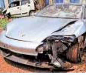
The Porsche car which killed two on May 19.