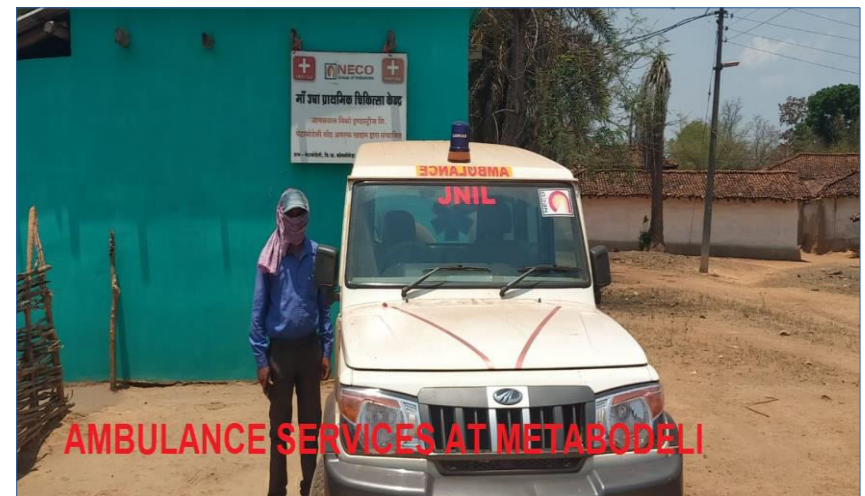
AMBULANCE SERVICES AT METABODELI