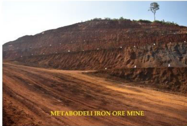
METABODELI IRON ORE MINE