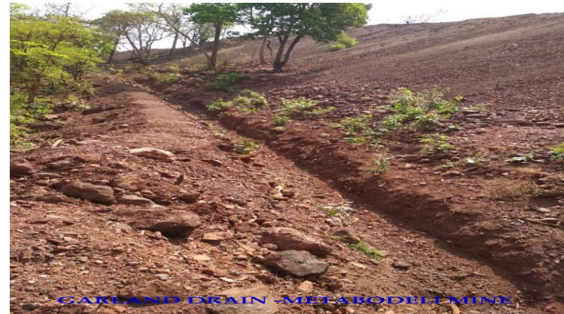
GARLAND DRAIN -METABODELI MINE

N CHHOTEDONGAR MINE , GARLAND DRAIN AND CHECK DAM ARE CONSTRUCTED.