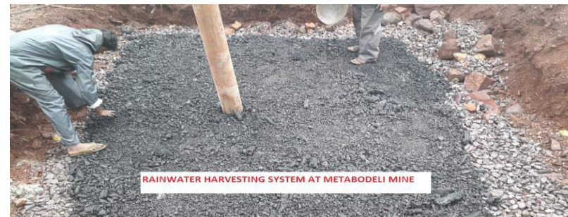
RAINWATER HARVESTING SYSTEM AT METABODELI MINE