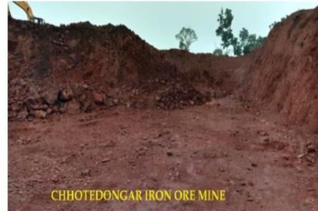
CHHOTEDONGAR IRON ORE MINE