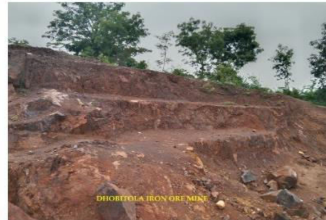
DHOBTOLA IRON ORE MINE