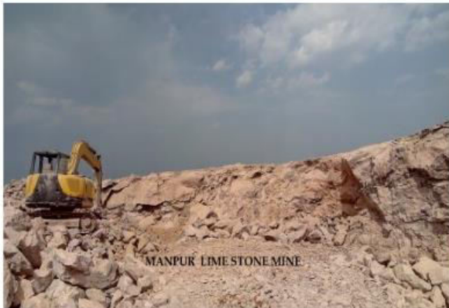
MANPUR LIME STONE MINE